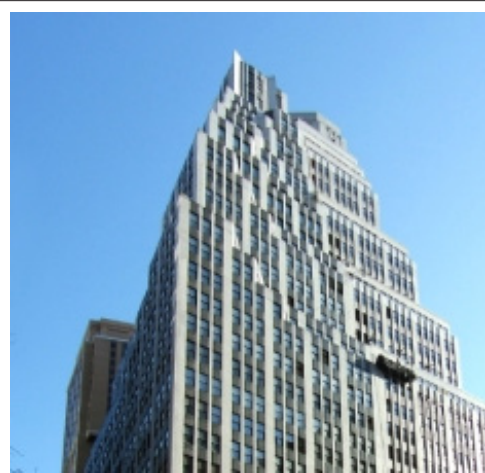
Ruyi Design recently leased 3,480 square feet at 1410 Broadway.